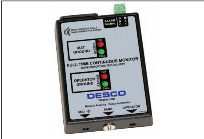
Figure 1. Desco Full-Time Continuous Monitor